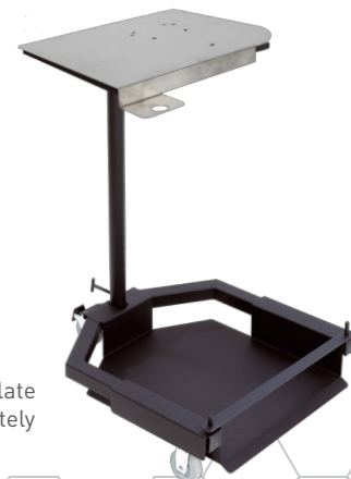
KITFR55DU *Stainless Steel Mounting Plate (KIT180MPPS) Sold Separately