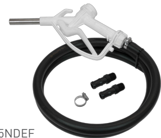
KITS05NDEF (suction hose not shown)