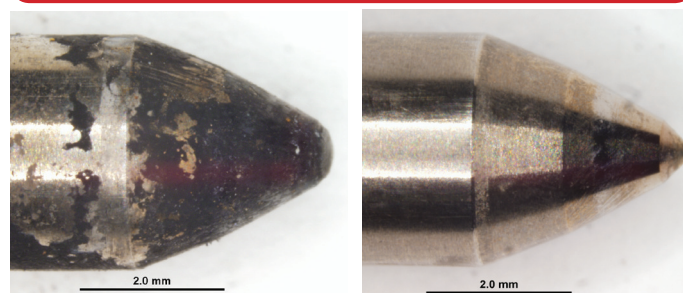
High Pressure Common Rail injectors before and after clean-up with fuel treated with Diesel Kleen + Cetane Boost.